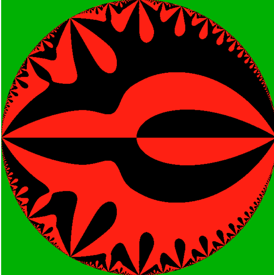
FIGURE 8.2. Phase of P_{-5}(q) on the unit disk